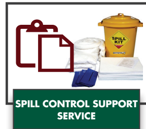
SPILL CONTROL SUPPORT SERVICE