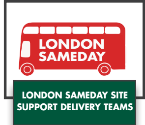
LONDON SAMEDAY SITE SUPPORT DELIVERY TEAMS