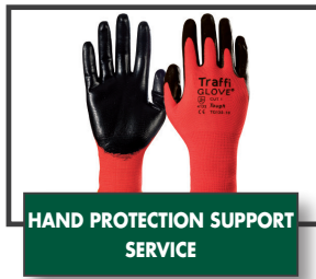
HAND PROTECTION SUPPORT SERVICE