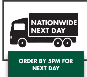
ORDER BY 5PM FOR NEXT DAY