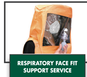
RESPIRATORY FACE FIT SUPPORT SERVICE