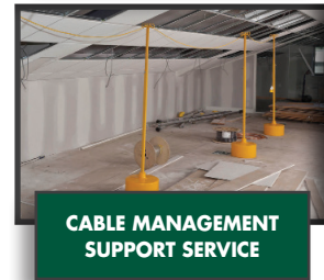
CABLE MANAGEMENT SUPPORT SERVICE

www.onsite-support.co.uk Stephenson Way, Crawley, West Sussex, RH10 1TN