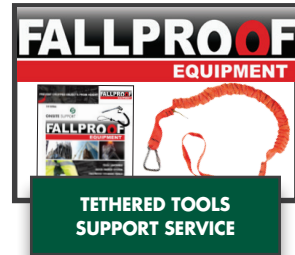
TETHERED TOOLS SUPPORT SERVICE