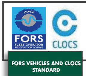
FORS VEHICLES AND CLOCS STANDARD