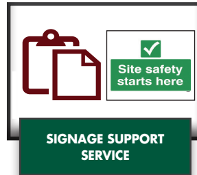
SIGNAGE SUPPORT SERVICE