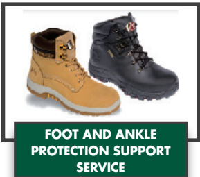
FOOT AND ANKLE PROTECTION SUPPORT SERVICE