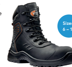
Sizes: 6 – 12