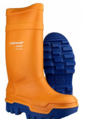
Sizes: 5 – 13