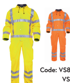
Sizes: S - 4XL