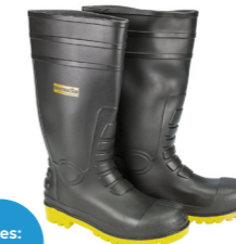
Sizes: 6 – 13