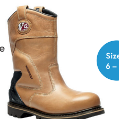
Sizes: 6 – 13