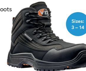
Sizes: 3 – 14