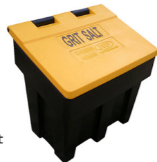
Code: CJ2GB200/ CJ2GB400