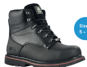
Sizes: 5 – 13