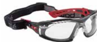
RUSHPFSPSI (Rush+ clear with foam & strap)