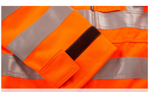
Double stitched ThermSAFE reflective tape for longevity

Colourfast with less than 3% washing shrinkage