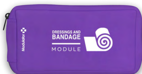
DRESSINGS AND BANDAGE MODULE