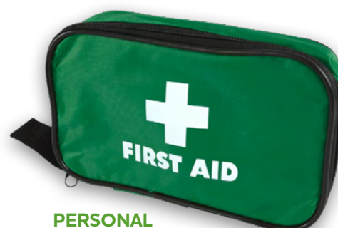
PERSONAL FIRST AID KIT