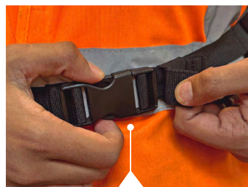
Quick Release Buckle allowing it to be easily detached