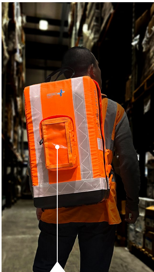
Prominent space for Asset Tags to be displayed front and back