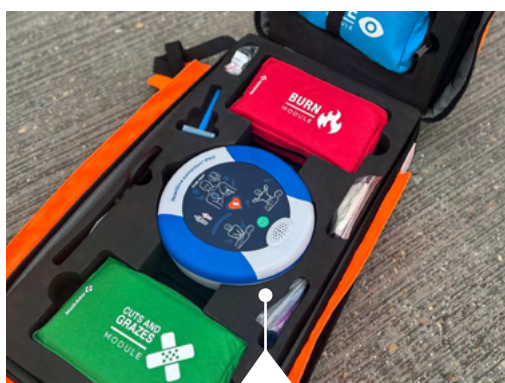
Thermal Insulation Foam for the AED to function in the cold