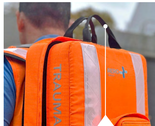
Reinforced Carry Handles