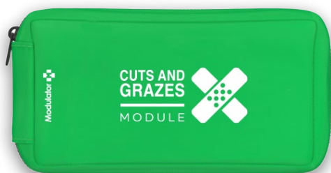
CUTS AND GRAZES MODULE